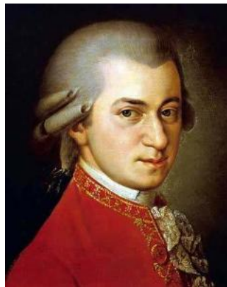
Figure 1: Mozart

What is an artist? Maybe in the eyes of ordinary people, artists often have a vague sense of mystery, is engaged in a variety of seemingly noble work in areas they cannot reach. For example, music master Mozart has a mysterious feeling for all of us. The melody of music seems to be able to continuously emerge from his brain, thus contributing to his music attainments beyond ordinary people's achievements. 1 Because of this, ordinary people always think that there is a deep gap between themselves and artists, and even think that they have no common language or no corresponding ideological and spiritual level with them.