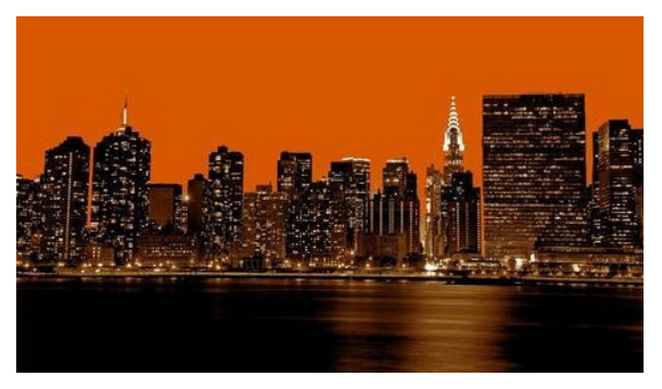
Figure 1: New York City Background in "Friends"

New York City, as the epitome of finance, culture, and the arts in the United States, holds a rich history and cultural heritage. In the popular sitcom "Friends", this city exudes a unique charm and ambiance. The geographical location of New York City provides an abundance of background elements for the show's plot. Iconic structures such as Central Park, the Empire State Building, and Times Square frequently appear in the series, offering a vibrant and diverse urban landscape to the audience. These landmark buildings not only showcase the urban scenery of New York City but also symbolize the city's prosperity and vitality [5]. Moreover, the characters in "Friends" often traverse through the city, engaging in various social activities and embracing the prosperity and convenience that the city has to offer. Simultaneously, they also grapple with the challenges and stresses of urban life, including traffic congestion and exorbitant housing prices [6]. These geographically-related plotlines add a sense of realism and a deeper layer of life to the overall narrative. Figure 1 presents a visual representation of the backdrop of New York City in Friends. It showcases various landmarks and locations that are integral to the show's setting, further immersing the audience into the unique world of the hit sitcom.