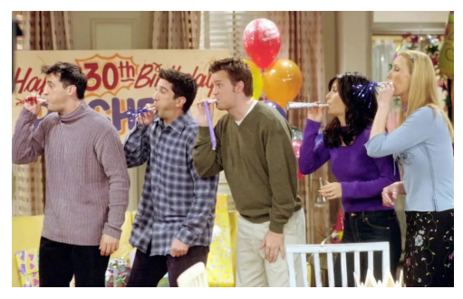
Figure 2: Pictures of attending parties in "Friends"

Through its examination of New York City's social culture, "Friends" offers a behind-the-scenes look into the city's social life and etiquette, allowing the audience to gain a deeper understanding of its rich cultural heritage.