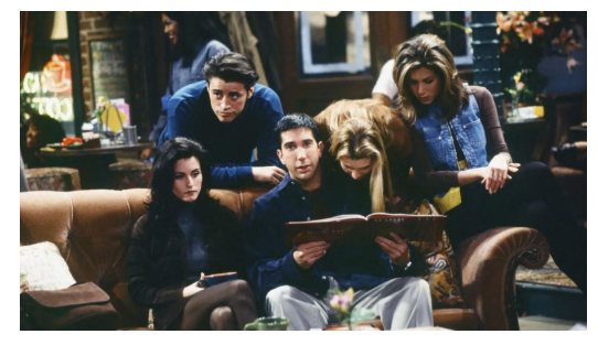
Figure 3: Coffee shops commonly seen in "Friends"

In summary, "Friends" offers a vivid portrayal of urban life in New York City, showcasing its diverse culture, fashion trends, and social etiquette. This cultural diversity enriches the plot, adding layers of complexity and interest, while also immersing the audience in the city's rich cultural heritage. The integration of specific cultural elements, such as the iconic "Central Perk" coffee shop culture, offers a window into the lifestyle and social habits of young New Yorkers during the show's era. This authentic representation not only enhances the realism of the plot but also fosters emotional resonance with the audience. Figure 3 shows the scenes in the common coffee shops in "Friends", which reflects the vibrant coffee shop culture in this city and its indispensable role in the life of New York people.