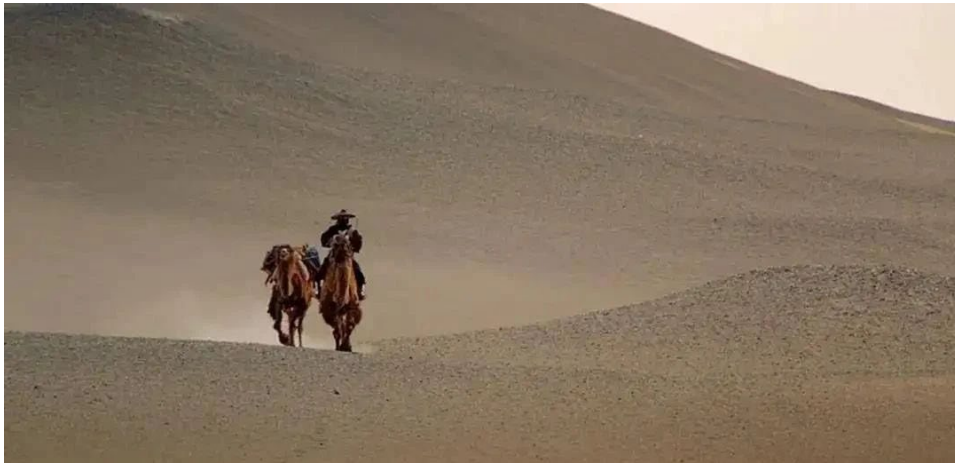
Figure 2: Dim film tone of New Dragon Gate Inn

Among the aesthetic characteristics of micro-films, the unique visual expression is particularly prominent. This uniqueness is not only reflected in the composition of the frame, the use of color and the language of the shot, but also in how it conveys the emotion and theme of the story through visual elements. Firstly, micro-films often break the rules in fame composition, using asymmetric, diagonal composition and other tension composition to highlight the focus of the story and the emotional changes of the characters. This composition method not only makes the frame more dynamic and visually striking, but also effectively guides the audience's line of sight and enhances the sense of representation of the story. Additionally, micro-films are also unique in the use of color, such as New Dragon Gate Inn , in which the story happens in the remote desert. The background of the story is the Ming Dynasty eunuch dictatorship, social darkness, political corruption, and the people struggle to live. Thus, the dim and dark tone of the film is used, creating a beautiful but depressed artistic atmosphere (as shown in the figure 2). [6]