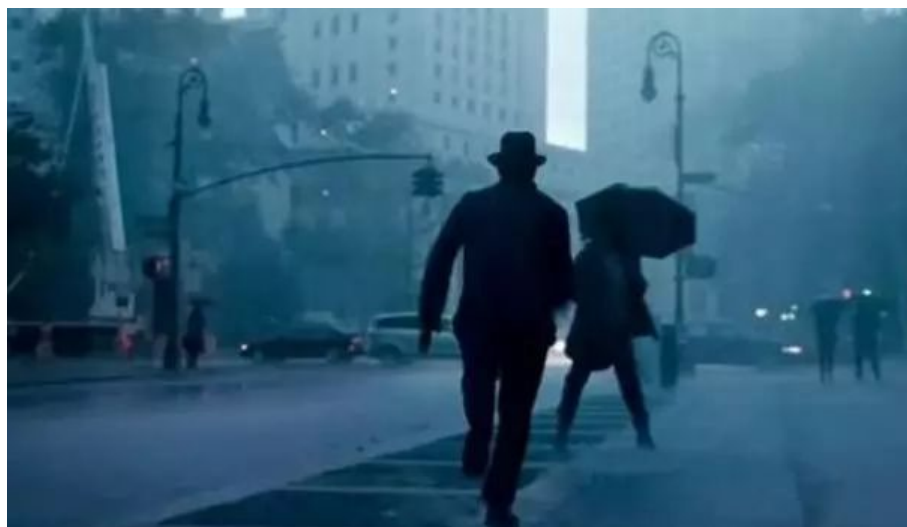
Figure 1: The motion lens makes the frame dynamic

Among the aesthetic characteristics of micro-films, detailed photography techniques play an indispensable role. This approach is crucial in the production of micro-films, making them more visually appealing and profound. For one thing, detailed photography techniques can highlight the themes and emotions of micro-films. By capturing and emphasizing the detailed elements in the scene, the photographer can precisely convey the themes and emotions intended to be expressed in the micro-film. In Fruit Candy , the use of a telephoto lens makes a simple push-rail shot much more interesting (as shown in the figure 1). Use a wide angle lens to push the camera closer to the actor, because a wide Angle lens will increase the sense of speed of the push rail, and the object will become large and disappear quickly. These details may be characters' expressions, actions, or specific objects or colors in the environment. Through careful selection and presentation of these details, micro-films can leave a deep impression on the audience. [5]