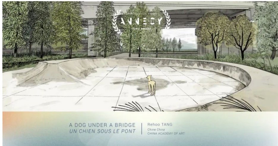
Figure 5: The film A Dog Under Bridge

empty, seemingly abandoned bridge Park and one of the abandoned insignificant animals is the meaning of the film's title " A Dog Under Bridge ". The geographical location of the city island and the life image of the social edge intertwine, resulting in a strong feeling of loneliness. Under the rule of social Darwinism, no matter the small people on the edge of the region or under the edge of the region, they are not only the edge of the life of the world, but also the others in the cultural construction, and their narratives are constantly rejected and squeezed. Tang Lihao's short animation extends the tentacles depicted to the outer edge of the urban space, depicting the pulsation of the urban edge rich in mechanism and texture with unique media means, showing a strong aesthetic tension (as shown in figure 5).