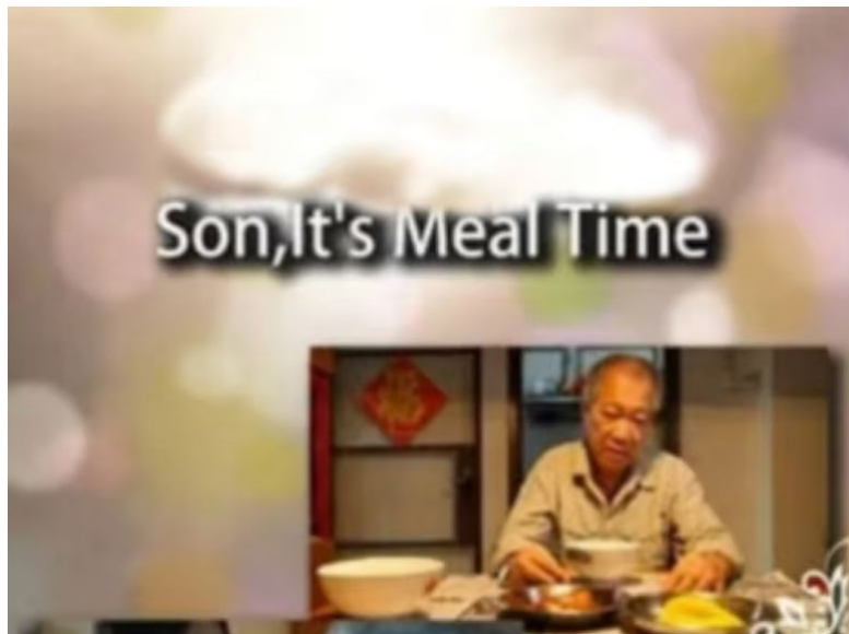
Figure 4: Son, It's Meal Time is aligned with the context of the times

father and son from the perspective of a bystander, adopting a small-scale approach to reflect the loneliness and indifference between people under the alienation of modern cities, as well as the “difficulty of communication” between fathers and sons of different generations, capturing the unusual aspects of ordinary people’s lives (as shown in figure 4).