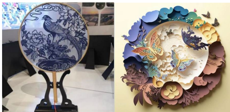
Figure 2: Group fan paper-cut pattern display

In Chinese folk, decorative paper-cut is the most common paper-cut, widely used in various customs. Guang Xin paper-cut more or as a kind of daily window decoration. Such as window cut, window side, window skirt, window top, door flower, wall flower and paper-cut couplets are common decorative paper-cut. Decoration of paper-cutting culture on the circle fan is also a major feature of southern paper-cutting, and also a stage to display paper-cutting technology. For example, the handmade ball fans in Figure 2 are decorated with paper-cut patterns to make them look more delicate. The ball fans have different styles, and each pattern represents the user's personality. At first, the ball fans could only be used by noble women in the court, and only pictures of ladies could be drawn on the fans. Later, when the ball fans were widely used, some paper-cutting artists combined paper-cutting art with the ball fans, and placed the beautiful wishes of women in the fans. The decoration of brilliant paper-cut works needs more attention. The composition and sense of picture should pay more attention to the expression of techniques and emotions, so that the paper-cut patterns are beautiful and generous. The application of lines and colors pays attention to the use of overlapping, contrast, deformation, exaggeration and other decorative techniques, so that the layers of paper-cut patterns are more rich.