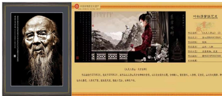
Figure 1: Three-dimensional character paper-cut design (work of Teacher Ye Qingsong)

The distinguishing feature of Guangxin paper-cut from other paper-cuts is that it is a three-dimensional artistic depiction. By using multi-layer color three-dimensional paper-cutting, emphasizing thematic creation and visual language, selecting special paper, integrating rigorous dyeing technology and sticking technology, each process is linked and key step by step, boldly using multi-layer color overlay production method, so that the plane paper-cutting art can produce three-dimensional effect. After picture creative processing, layering, painting, smoking, engraving, mounting and other more than 30 procedures to complete. For example, Figure 1 shows the three-dimensional figure paper-cut works of Master Ye Qingsong. It is not difficult to see that three-dimensional carving works are made by using flat paper-cut. Use black, white and gray to make the whole work become three-dimensional. Among them, the key part of "image processing method" and manual "dyeing paper" technique are very important links of color multi-layer three-dimensional paper cutting technology. Characteristics of paper carving: "Yin engraving see color, Yang engraving see knife, according to the shape of objects, with the class of color", with "full composition, vivid modeling, gorgeous color, unique technology" and other characteristics; Especially in the aspect of portrait, more traditional paper-cut incomparable unique artistic techniques.