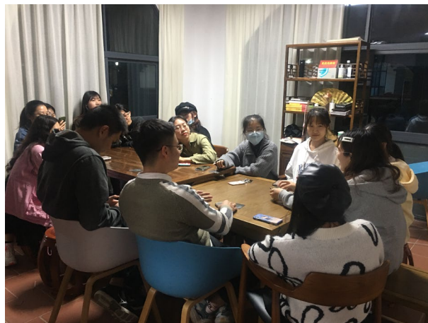
Figure 1: Oral English environment for interactive communication

To make better use of mixed English teaching, we must create an interactive English environment, implement the idea of "student-oriented" into English teaching, truly mobilize the enthusiasm of English and reduce their negative psychology. For example, for the course mentioned in the chapter "If you want to talk you can go online", the teacher can use the content of this chapter to let students sit together, discuss the advantages and disadvantages of network communication, and communicate through the network, so as to deepen the connection between network communication and network communication, and cultivate their independent thinking ability. Secondly, in this way, teachers can let students express their views through PPT and debate, and then express their ideas in English, let them "blurt out" English, let them realize that English is not a very difficult thing, so as to improve their confidence, let them no longer "drift", But more actively into the teaching of English. On the other hand, in the process of expressing their ideas in English, they develop their thinking ability in English and realize the similarities and differences between English thinking and Chinese thinking. In this case, the teacher should master the speed of the class, and promptly stop the students talking about the content. Create an English speaking environment where students can interact, as shown in Figure 1.