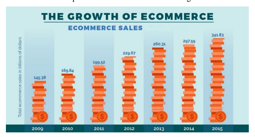
Figure 2: The growth of ecommerce

Under the internet mindset, enterprises should prioritize the expansion of their consumer base and continuously expand their audience to heighten their brand effectiveness <sup>[27-29]</sup>. In order to expand the consumer group, it is essential to continuously conduct in-depth research on the consumer group, adopt big data to probe into consumers' consumption habits and characteristics, understand the composition of the consumer group, and ultimately achieve are planning of the consumer group <sup>[30-31]</sup>. Meanwhile, it is also imperative to continuously explore potential customers and adjust marketing strategies in a timely manner to ensure more scientific sales deployment. Under the internet mindset, the marketing channels of enterprises have been expanded in multiple dimensions. In such case, enterprises need to form a relatively distinct consumer group concept, conduct in-depth research on the characteristics of dissimilar consumer groups, continuously adjust the functions and promotional models of products, and deeply explore the purchasing characteristics of target and potential customers, psychological decision-making factors, etc., so as to consolidate the position of the enterprise in the hearts of consumers and elevate its business profits <sup>[32-35]</sup>. It can be showed at figure 2 as follow: