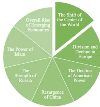
Fig. 1 Specific content of the World Marked by Changes Unseen in a Century