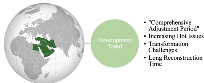
Fig. 4 Development trend in the Middle East

According to the current development trend of the Middle East, this paper summarizes the development trends of the Middle East in four aspects, as demonstrated in Fig. 4.