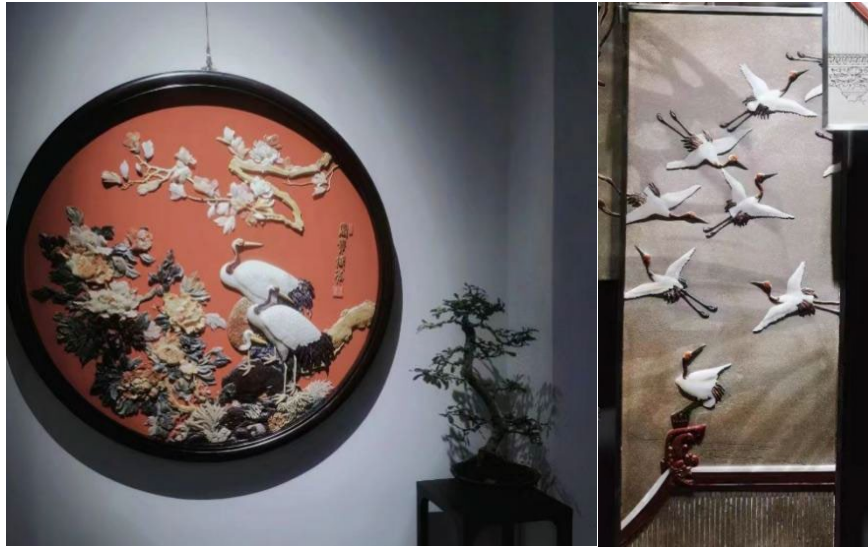
Figure 3: Chinese painting works

techniques to achieve the clever design of "painting in jade, painting melting jade", drawing on the composition and artistic conception of traditional Chinese painting, cleverly avoiding the existence of locks, and transforming cotton into a unique image - snow in the sky. Through exquisite carving techniques, the cotton in the jade is transformed into falling snowflakes, creating a peaceful and elegant atmosphere. Jade carvings can also be added to Chinese painting works to create new forms of expression, as shown in fig. 3.