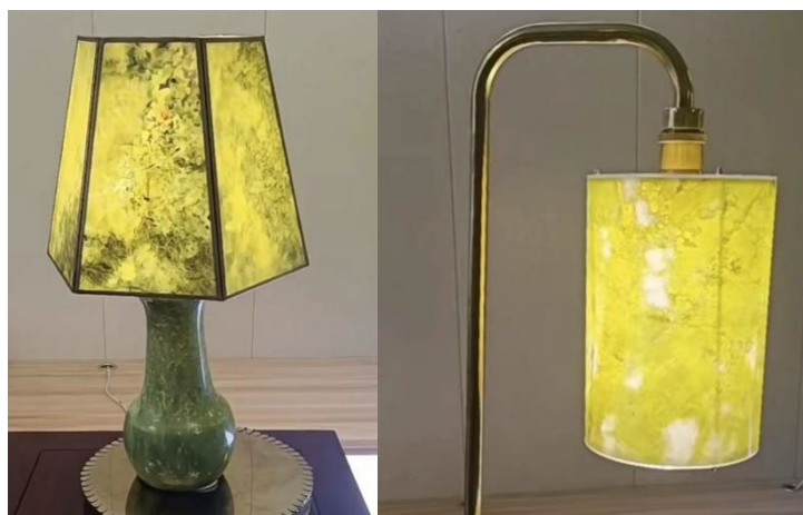
Figure 2: Shell products

The fusion of folk paper-cutting craft and traditional jade carving. The texture of paper cutting has a unique artistic effect. The paper cutting technique is used on the surface of jade carving to produce a concave and convex texture, which increases the three-dimensional sense and layering of the work. The patterns and elements of paper cutting are applied to jade carving works, and the material and shape of jade carving can also be combined with paper cutting to create a unique art form. The use of paper-cutting techniques to produce jade carving works with hollow effect, through the hollow effect and part of the jade itself light transmission to produce lamp shell products, as shown in fig. 2.