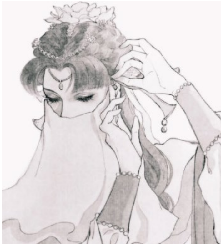
Figure 2: A painting of the "portrait" category