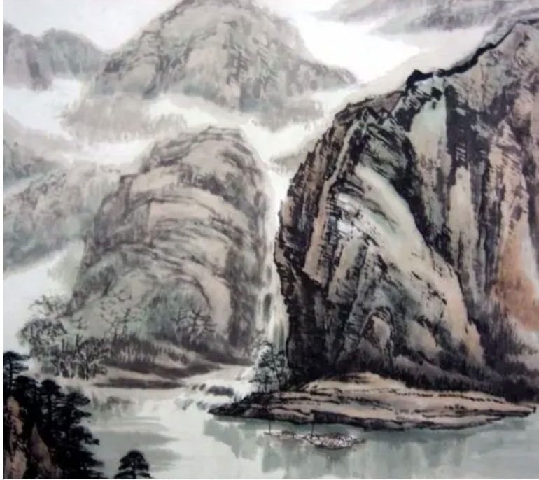
Figure 1: An ink painting with the theme of "Landscape"