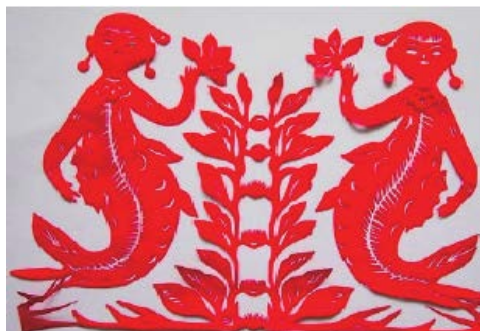
Figure. 1 Paper cut of fish body doll

On the one hand, it can improve students' creativity. Through the reasonable grafting of the unrelated things in the original text, a new artistic image is created. It mainly includes two kinds: replacement composite and aggregation composite. For example, the paper-cut of "fish body Doll" reflects the replacement and combination of the partial image of one object and another, as shown in Figure 1. As shown in Figure 2, the paper-cut works of "golden pig congratulation and longevity" are mainly assembled and compounded. First, the modeling outline of the work is designed, and then the interior of the work is filled. On the other hand, it helps to cultivate students' ability of plane modeling. This is a common method in folk art modeling, which embodies a kind of two-dimensional natural beauty.