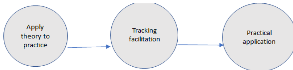
Figure 2: After-school practice