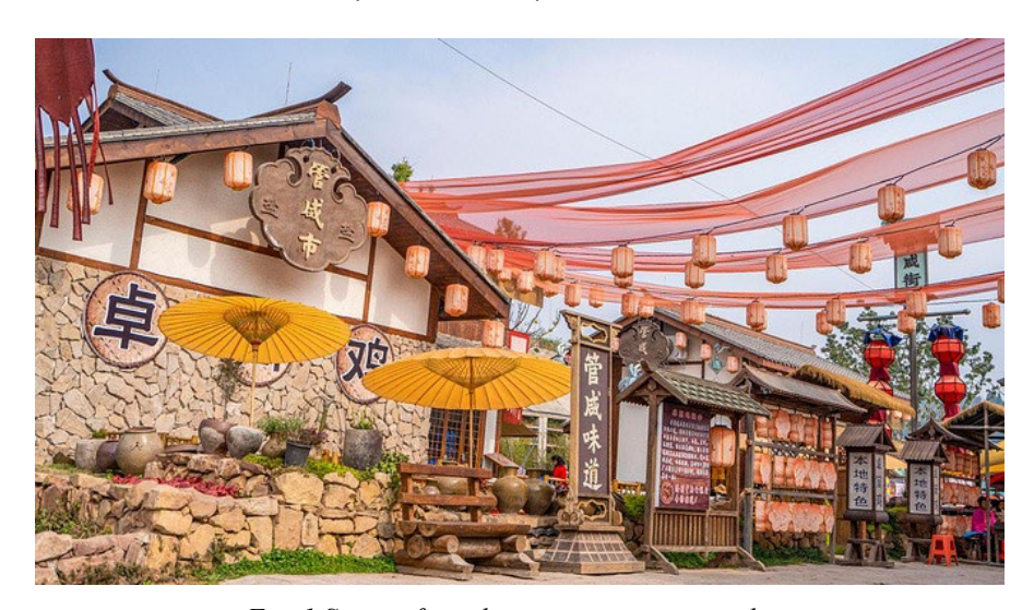
Fig. 1 Scene of rural tourism in a certain place