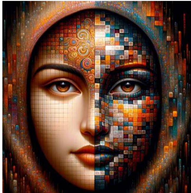
Figure 3: Examples of AI-generated content from diverse cultures, illustrating innovation and cultural fusion.

Possible loss of cultural context: Information generated by AI may oversimplify or distort cultural symbols and traditional ideas. For example, an AI model trained on a limited global art dataset may inaccurately incorporate elements from different cultural traditions and thus fail to fully understand their significance, which can lead to unintended cultural misunderstandings, as shown in Figure 3.