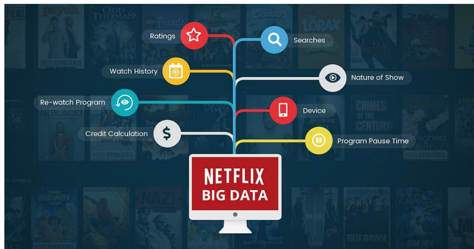
Figure 1: Netflix's Recommendation System

(1) Netflix Recommendation System as an in-depth case study that explores in detail how Netflix is leveraging AI technology to deliver customized content on a global scale, as shown in Figure 1. The presentation of films, television programmes and documentary films from various cultural heritage on the international stage helps to promote exchanges and interactions between different cultures.