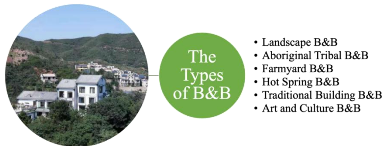
Fig. 4 Main characteristic types of rural B&B

From the cultural perspective, the development and construction of rural B&B tourism must be based on ecological culture. Moreover, for different rural areas, they have their own different cultures, details and cultural customs, which is also an indispensable reason why these villages can attract tourists. With the continuous development of ecological civilization construction, this paper believes that rural B&B tourism should also integrate the relevant cultural content of ecological civilization construction into the development of tourism industry [5]. This can not only realize the combination of rural B&B tourism and ecological civilization construction, but also highlight the local characteristic ecological culture, so as to enhance the local villagers' awareness of sustainable development, so as to protect the local ecological environment and attract more tourists. Figure 4 shows the main characteristic types of current rural B&B.