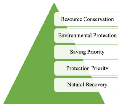
Fig.3 Principles of ecological civilization construction

ecological environment protection is undoubtedly the top priority of ecological civilization construction, and it is also the main content of ecological civilization construction [3]. For rural B&B tourism, a good ecological environment is an indispensable factor for the sustainable development of rural B&B tourism, which is mainly reflected in rural B&B construction, rural environmental tourism, rural local characteristic products and so on. Therefore, rural B&B tourism and ecological civilization construction are based on a good ecological environment. In addition, the tourists who choose the rural B&B tourism mode are more due to the local natural and cultural environment, which also reflects the importance of ecological civilization construction in rural B&B tourism. Fig. 3 demonstrates the principles of ecological civilization construction.