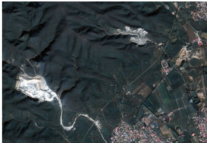
Figure 1: Mine RS monitoring screen

If the solid waste violates the relevant standards in the process of stacking and is not properly managed, it will easily slide under the influence of rain and vibration, which will have a serious impact on the surrounding environment. In the process of land use, every characteristic and future development mode must be considered [10]. There are many detailed information about land, and it will change greatly with the passage of time, the change of natural environment and human intervention. In some mines, underground storage is used in the process of excavation, which changes the distribution of groundwater, greatly affects the stability of surface structure, and then causes disasters such as collapse. Figure 1 shows the RS monitoring screen of the mine.