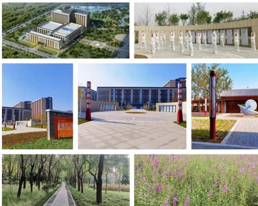
Figure 2: Binzhou Traditional Chinese Medicine characteristic theme culture park

The law of TCM requires to build a number of publicity carriers such as TCM health culture park, TCM health culture courtyard, TCM health culture street and TCM health culture display wall with TCM health preservation as the main body, so as to advocate the concept of TCM health preservation, spread TCM health knowledge and spread the concept of "prevention of diseases". Binzhou TCM characteristic theme culture park is built based on Binzhou TCM hospital. The landscape design covers an area of about 30000 square meters, mainly including landscape, square, rockery, sculpture, herbal plantation, newly-built Garden Road greenway and other projects. The park is composed of one axis, one belt, five gardens and six districts. In the landscape design, by extracting TCM cultural elements, character sculpture, cultural landscape wall and ground sculpture are set to show the breadth and depth of traditional medicine skills, so as to make the overall landscape environment full of traditional medicine charm [4] . The park mainly introduces Chinese medicinal materials such as tamarium, Acer and red amaranth, and the basic knowledge of Chinese medicinal materials such as tamarium and red amaranth is mainly introduced to the masses. The park mainly introduces Chinese medicinal materials such as tamarium and white amaranth. It embodies the strong theme characteristics of TCM. At the same time, Binzhou Museum of TCM will be built and opened to the public free of charge.