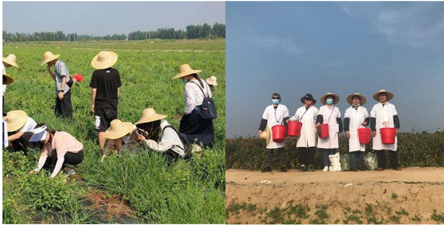
Figure 1: Traditional Chinese Medicine planting demonstration base