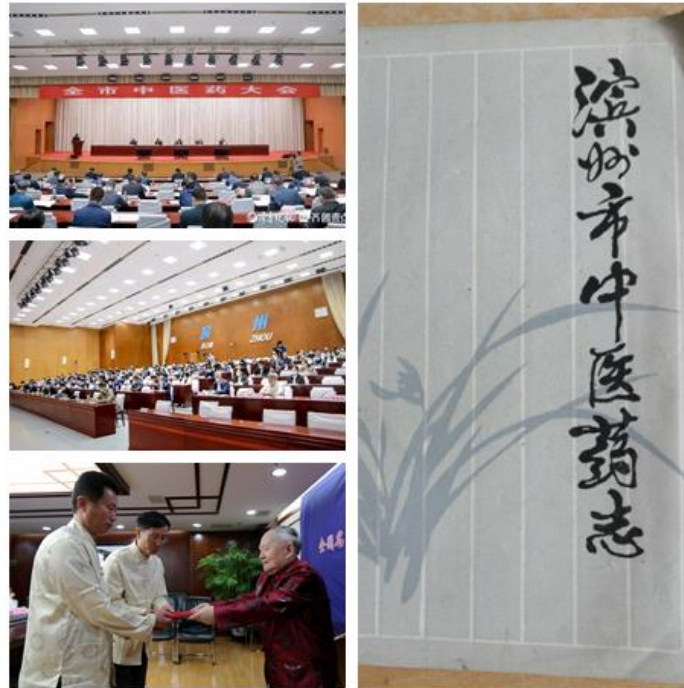
Figure 4: Inheritance of characteristic Traditional Chinese Medicine in the Yellow River Delta

unilateral prescriptions, ancient books and documents of TCM categories scattered among the people. After evaluating the clinical efficacy and safety of characteristic therapy, remove the weeds and save the turnip, and tap the valuable folk medical experience.