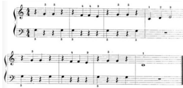
Figure.1 Example of Piano Staccato

Secondly, legato is another kind of basic performance technology, but it runs through the whole process of performing music. In terms of technical points, players must be clear about the impact of their own key way on the piano timbre, which will determine the feeling of music. In general, the technique of legato requires the player to touch the key with his fingers and abdomen. The speed cannot be too fast, and the height cannot be raised, so as to ensure the integrity of melody. Because legato is also the basic performance technology, so it is also involved in the performance of national music. For the purpose of nationalization, the performer should control the piano timbre and try to be close to the national culture of our country, especially in the decorative sound. Figure 2 example of piano legato score.