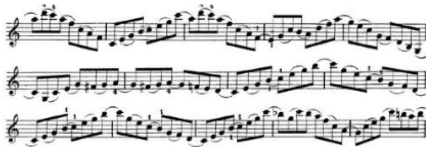
Figure.2 Example of Piano Legato Score

Secondly, legato is another kind of basic performance technology, but it runs through the whole process of performing music. In terms of technical points, players must be clear about the impact of their own key way on the piano timbre, which will determine the feeling of music. In general, the technique of legato requires the player to touch the key with his fingers and abdomen. The speed cannot be too fast, and the height cannot be raised, so as to ensure the integrity of melody. Because legato is also the basic performance technology, so it is also involved in the performance of national music. For the purpose of nationalization, the performer should control the piano timbre and try to be close to the national culture of our country, especially in the decorative sound. Figure 2 example of piano legato score.