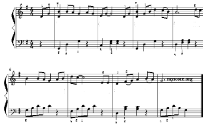
Figure.3 Example of Chinese Classical Piano Performance: Red River Valley

Taking classicism as an example, in the development of nationalization of piano performance in China, the technical style emphasizes classical culture, while the national culture in China belongs to traditional culture, which shows that the two have something in common at some level. At this time, the performer can replace the musical elements in the conventional classical music with the elements of national culture in China, so as to form a unique Chinese classicism style, On behalf of the piano performance further to the direction of nationalization. Figure 3 Red River Valley, an example of Chinese classical piano performance.