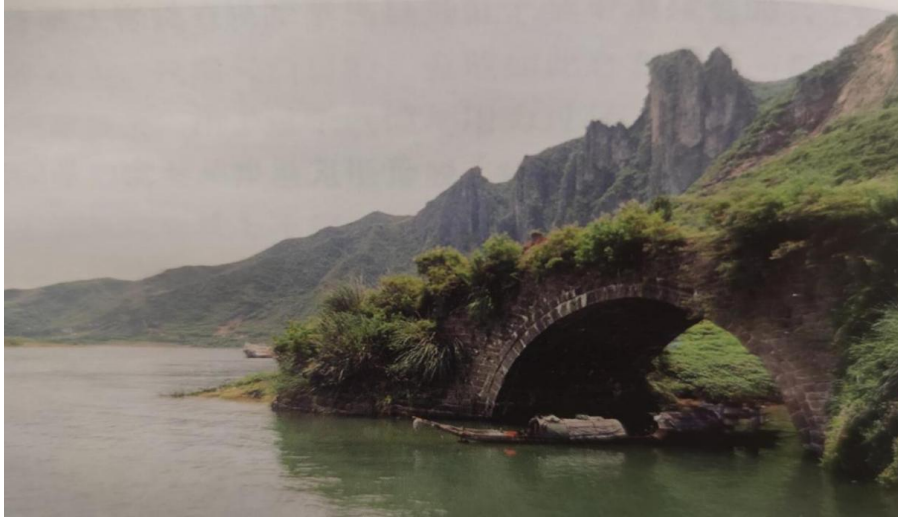
Figure 2: Xinnv Bridge

The picture comes from the book Luxi, the birthplace of Panhu culture