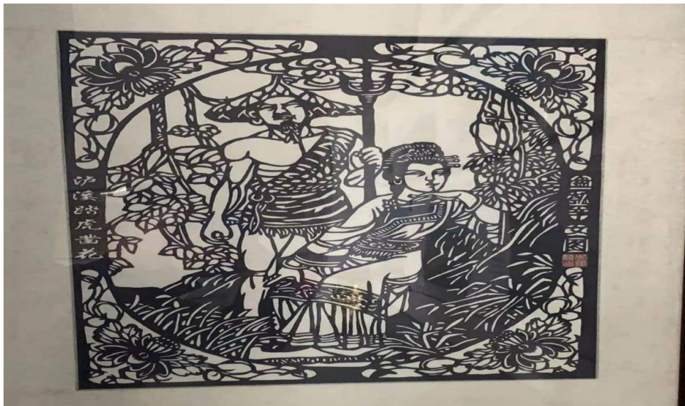
Figure 3: Step tiger chisel flower

① Create unique cultural IP. Xinnvpanhu culture belief has been popular for a long time and is an indispensable part of local people's spiritual and cultural life. Take xinnv Panhu culture as the core, carry forward its cultural core of honesty, loyalty to love and equal respect, and make use of the characters of xinnv and Panhu to create a unique local culture. Through the publicity film of public welfare tourism, highlight the emotion in the story of "xinnv and Panhu", build a cultural brand relying on emotional resonance, realize cultural experience relying on historical stories, innovate cultural scenes relying on natural scenery and historical sites, and develop tourism with national characteristics.