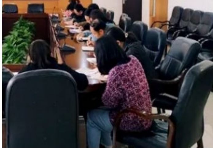
Figure 3: Teacher Seminar

In this way, we can realize the innovation of teaching mode, inject new teaching vitality into college students' Ideological and political education, and promote the continuous development of Ideological and political education.