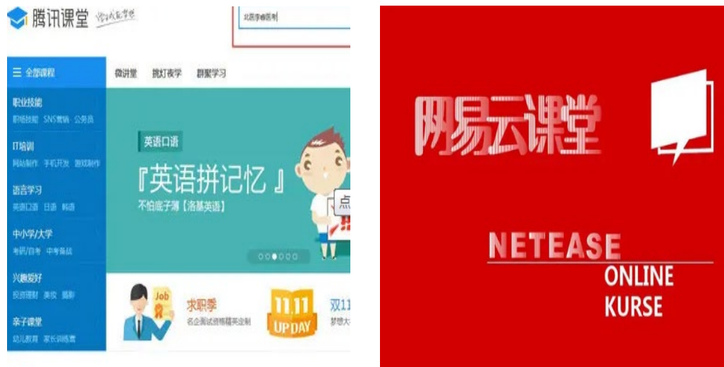
Figure 2: New media teaching platform

and political education of students in a subtle way [6]. Some new media teaching platforms are shown in Figure 2.