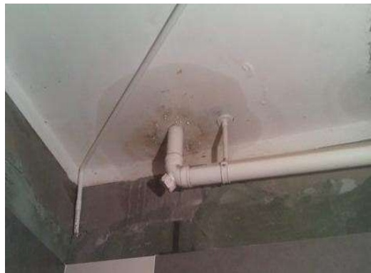
Figure 3: Kitchen and toilet leakage