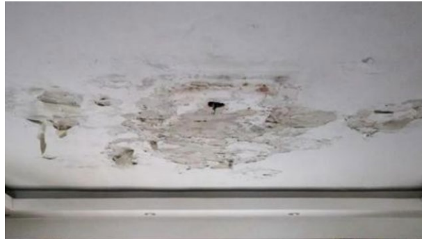
Figure 2: Roof leakage