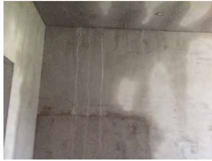
Figure 1: Wall leakage