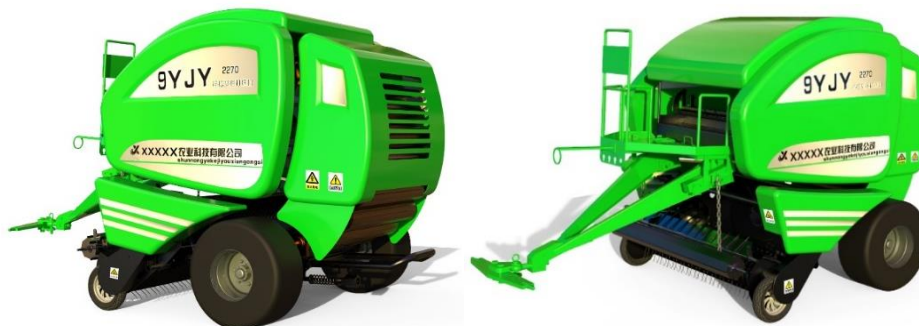
Figure 3: Design scheme of a baler's appearance.