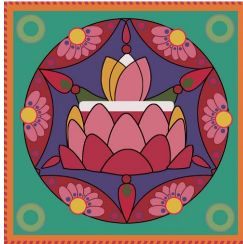
Figure 3: Lotus lamp pattern design.

Lotus lantern is one of the most representative lamps in plant lamp. "He" and "and" homonym, meaning family harmony, sustenance of the couple's future life wishes, reunion and beauty, harmony and happiness. Suitable for tying the knot (shown in Figure 3).