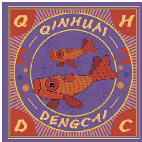
Figure 2: Pattern design of Koi lamp.

Koi represents wealth, luck and health, and is regarded as a symbol of peace and friendship. China has since ancient times "carp yue Longmen" said, expressed the lofty ideal upstream spirit, suitable for the gold list title this theme (As shown in Figure 2).