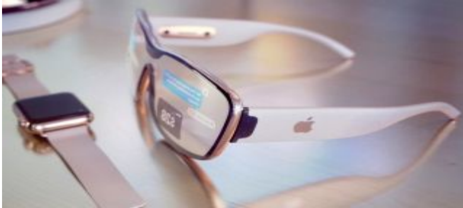
Fig.4 Conceptual Picture about Apple Glasses

In recent years, owing to the development of 5G and other communication technologies and the popularization of Cloud Computing, information transmission speed and carrying capacity have been greatly improved. In particular, the popularity of 5G has created technical conditions for the upgrading of mobile smart devices. For Apple, the world's most powerful technology company, the advancement of 5G technology will not only help its iPhone and iPad upgrade, but also promote its development of AR/VR technology and autonomous vehicles. For Online Learning,