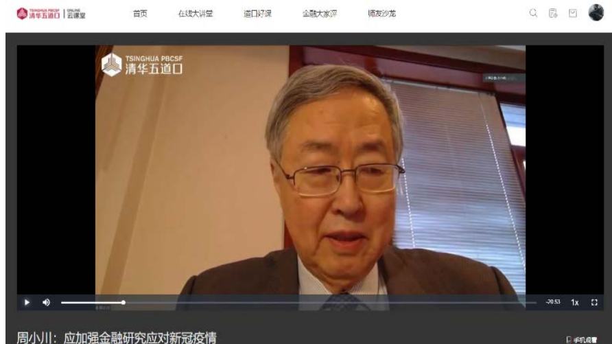
Fig.2 Zhou Xiaochuan: Financial Research Should Be Strengthened to Deal with the New Crown Epidemic