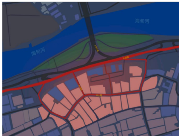
Figure 3 Plan of Zhongshan Road

The sequence of space plays a decisive role in the expression of architectural space image. Sequence space can give architecture clear direction from time and space, so as to strengthen people's recognition and good feeling of architecture. Zhongshan Pedestrian Street mainly presents the spatial sequence through the longitudinal level parallel to the Haidian River. Its good spatial sequence makes it a unique architectural product of beauty (Figure 3).