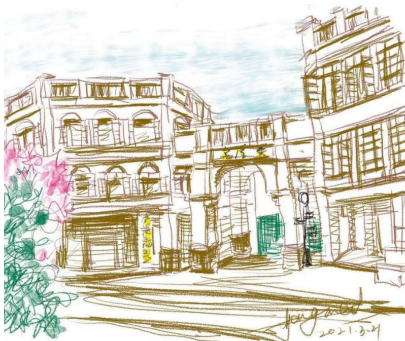
Figure 6 The view from No. 2 node

Finally, the street height and width of the arcade building in Hainan are constructed according to the proportion relationship between the street and the building in the western Renaissance period. It is not as tall and majestic as the skyscrapers of modern cities, but adopts the street building scale suitable for Hainan. It is precisely this appropriate street and building scale that is effectively integrated into the life content of Hainan people and becomes the material and emotional object that can be perceived and controlled in the memory of local residents.