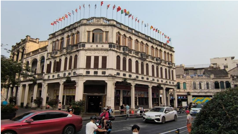
Figure 8 Facade of street intersection where Guoxing Library

The facade of the arcade complies with the three-stage principle of western medieval architectural aesthetics. Three horizontal, five vertical or more. It's a very classic aesthetic model(Figure 8).