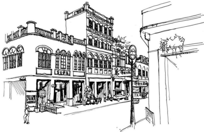
Figure 5 The view from No. 1 node