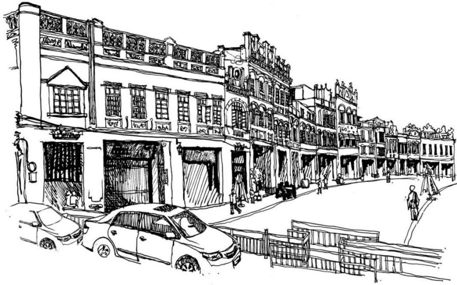
Figure 7 The view from No. 4 node