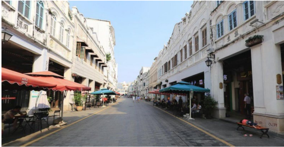
Figure 1 Street of Zhongshan Road