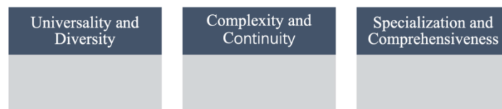
Fig. 2 Characteristics of post disaster psychological assistance

Different from ordinary psychological assistance, post disaster psychological assistance has three characteristics, as illustrated in Fig. 2.