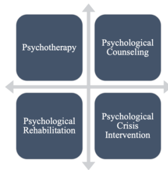
Fig. 1 Contents of post disaster psychological assistance