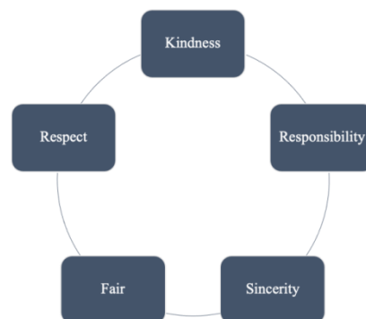
Fig. 4 Basic values of post disaster psychological assistance

In essence, psychological intervention in post disaster crisis requires staff to have professional psychological intervention knowledge, high enthusiasm, enthusiasm and calm mind. At present, China's psychological assistance professionals are relatively scarce. In the evening, the author believes that major universities in China should set up relevant psychological crisis intervention majors as soon as possible to cultivate more psychological assistance talents for the society, so as to cultivate and reserve high-quality professional teams for China's psychological assistance departments. Fig. 4 points out the basic values of post disaster psychological assistance, which is the literacy that every post disaster psychological crisis intervention professional must have.