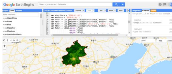
Figure 2: The interface of GEE

GEE is an open platform to process and analyse geoscience data. With powerful computing ability and open environment, GEE makes it possible to program and process remote sensing data online without downloading images. The interface of GEE is shown below.