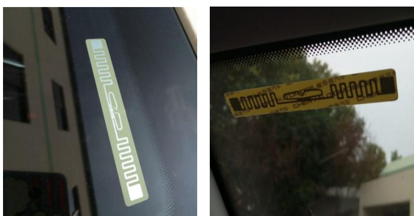
Figure. 1 TIGGO8 RFID electronic tag

Chery automobile manages the whole vehicle after off-line production. The ultra-high frequency anti-disassembly RRID tag is used as the data carrier of each vehicle; the RFID handheld terminal is used as the main data acquisition tool, and the front-end data is unified managed by the vehicle traceability system platform. The system can be extended to the production management in the front section, and then to logistics management and after-sales traceability.