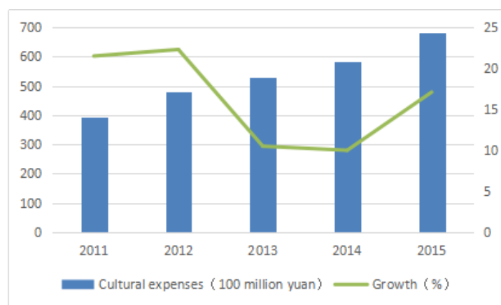
Fig.2 National Cultural Undertaking Fees and Growth Rate during the Twelfth Five-Year Plan

While the state attaches great importance to the promotion of excellent traditional culture, it also continues to innovate the inheritance method in accordance with the trend of the times. Among them, colleges and universities' cultural venues have become an important carrier for inheriting excellent traditional culture.