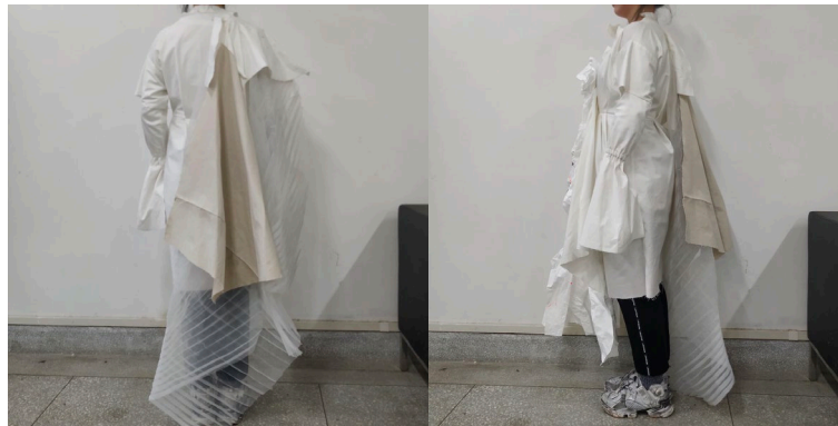
Figure 11: Sample garment making drawing back and side.