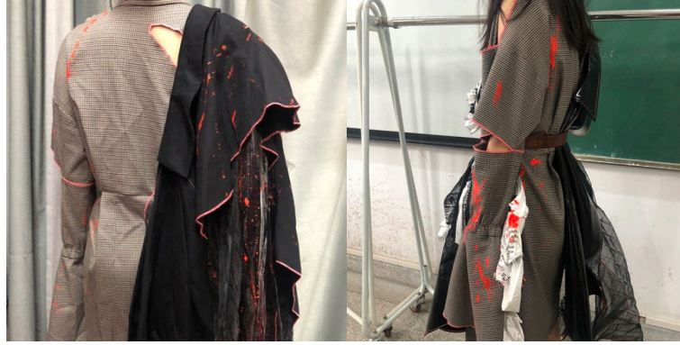
Figure 8: Thousand bird box fabric.