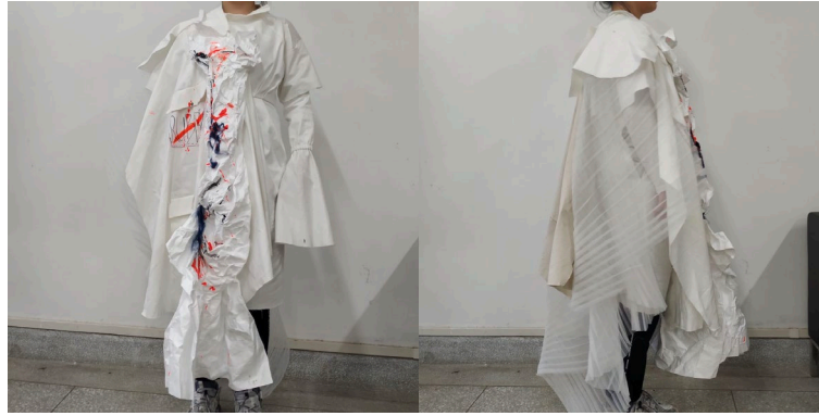
Figure 10: Sample clothes making drawing front and side.