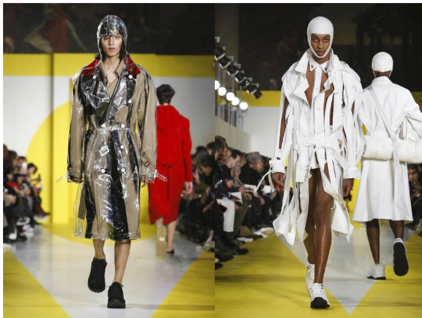
Figure 1: Maison Margiela Autumn and winter 2018.