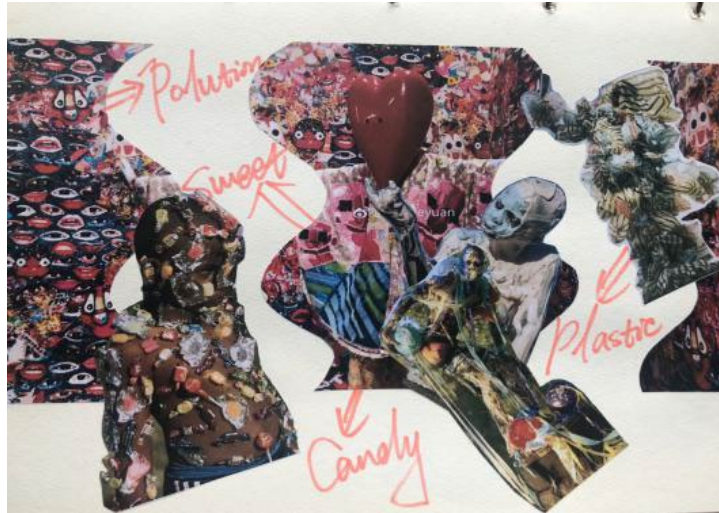
Figure 5: Environmental art design drawing.