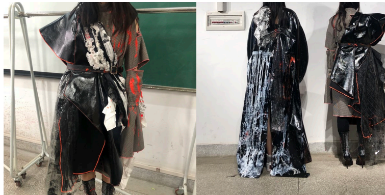
Figure 9: Patent leather fabric fabric.

The rendering of patent leather fabric is shown in figure 9: