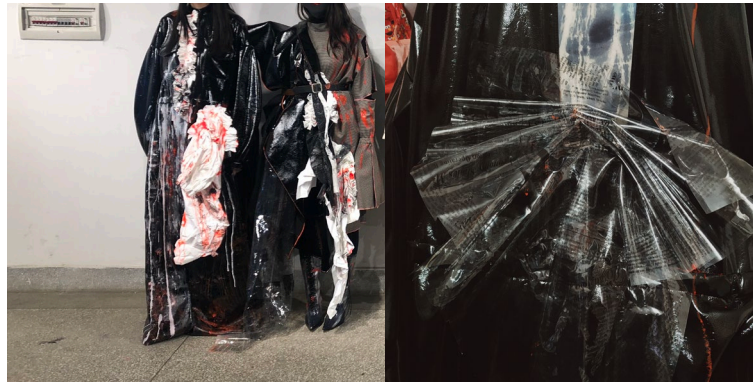
Figure 12: Garment making detail drawing.

See the pictures as shown in figure 12 and figure 13: