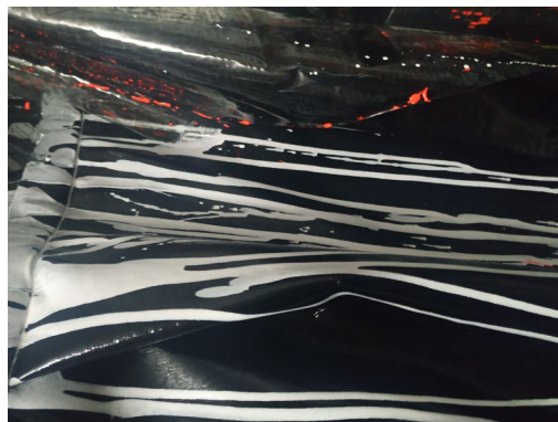
Figure 13: Detail drawing.