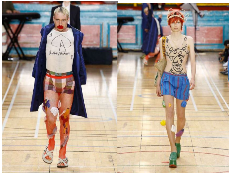
Figure 2: Vivienne Westwood Spring / Summer, 2018 .