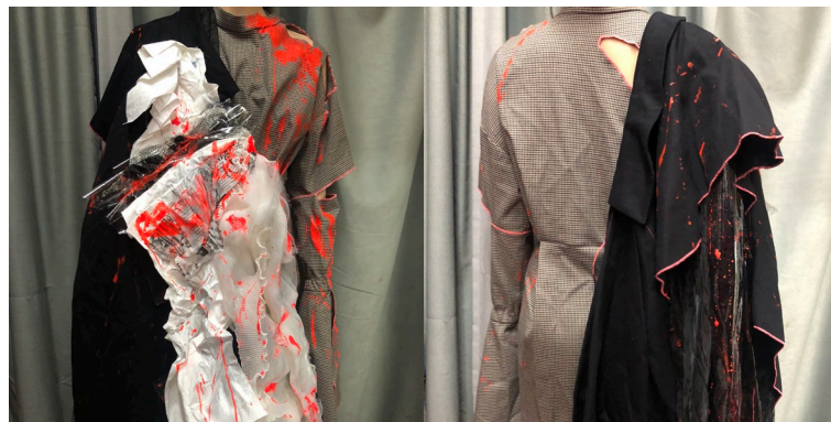
Figure 7:Denim fabric.

The rendering of denim clothing fabric is shown in Figure Figure 7: