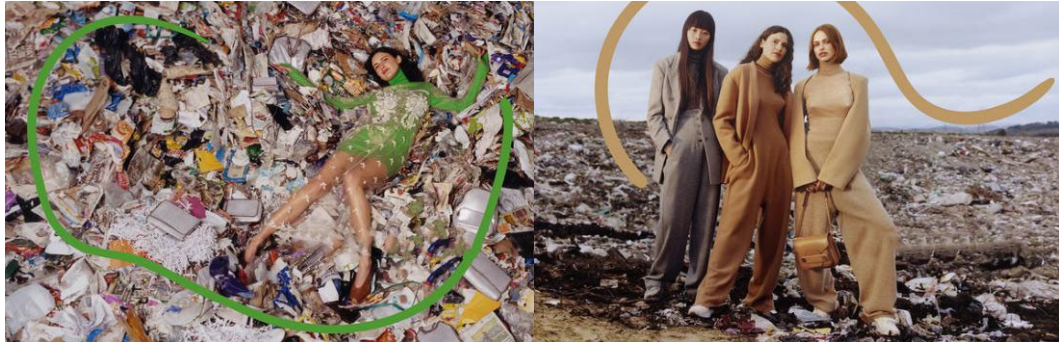
Figure 4: Stella McCartney 2017 Autumn and winter series of advertising.