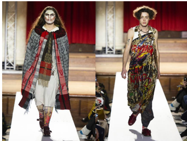
Figure 3: Vivienne Westwood Autumn / Winter 2019.